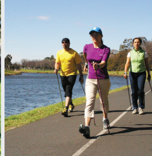
Total Body Fitness