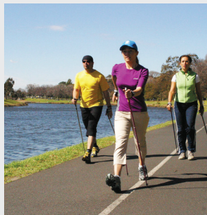
Total Body Fitness