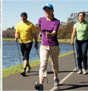
Total Body Fitness